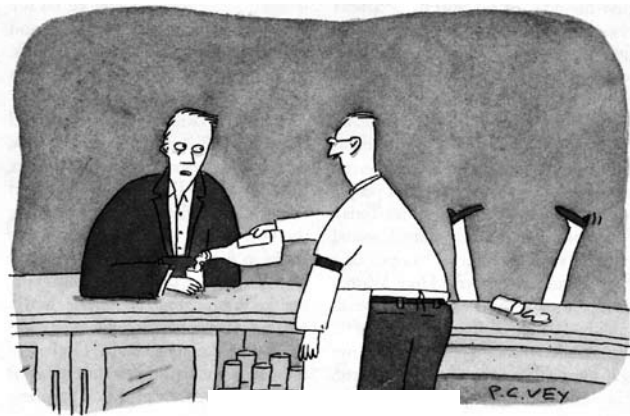
"My feelings about her continue to evolve."