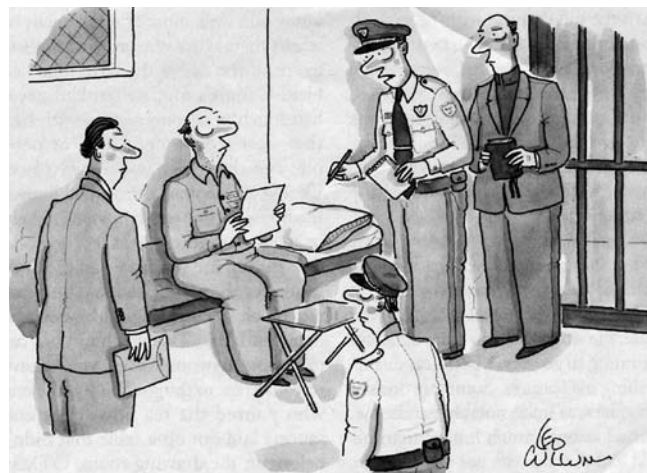
"I'm sorry. The beef Wellington has to be ordered twenty-four hours in advance."