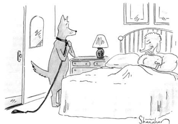
"Leave it on."