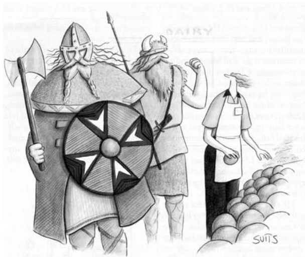
"We made a bit of a mess in Aisle 2."