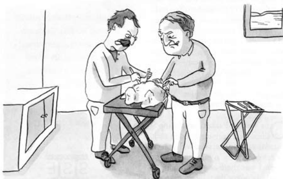
"There's gotta be an easier way to get candy from a baby."