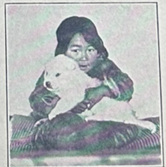
She lives Far-Far North!