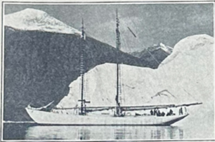
MacMillan's Arctic Ship, the BOWDOIN, in North Greenland

"He held the audience enthralled for nearly two hours. His photographs, both stills and movies, are superb. He is in my estimation one of the best lecturers on the American platform."